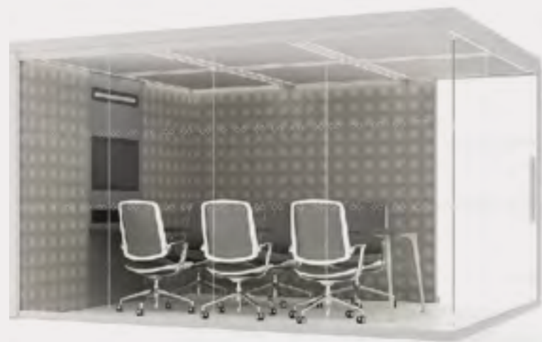
Infinity 4 Six Person Pod 3000 x 4050