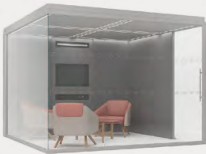
Infinity 3 Four Person Pod 3000 x 3050