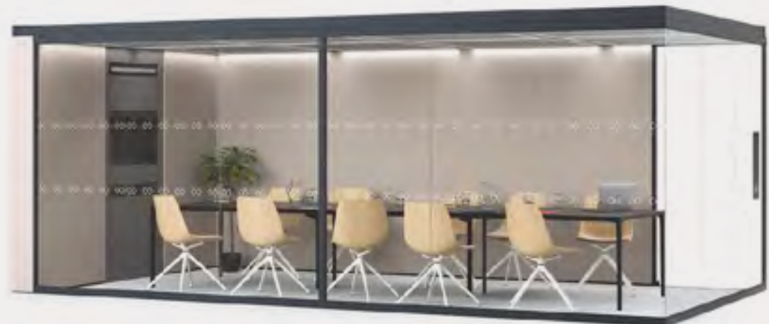
Infinity 5 Six Person Pod 3000 x 6050