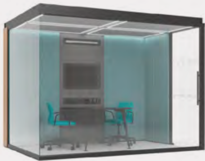
Infinity 2 Three Person Pod 3000 x 2050