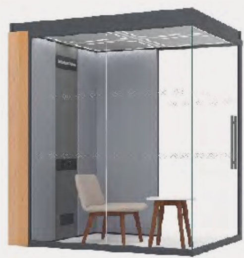
Infinity 1 Focus Pod 1500 x 2050